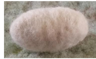
Continue needle felting until the fibres smooth over and stay put with a gentle tug.