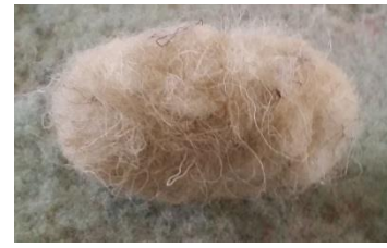
You end up with a lozenge or bean shape core that is perfect for the hedgehog body. Needle felt a little more to smooth off.