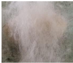
Pull away small wisps of off white wool felt fibre to cover the body and needle felt in.