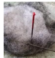
Fold over the fibre loose edges onto the inside of the wadding and needle felt around so all the wisps are neatened.