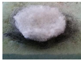
Lay wisps of dark grey colour onto the felting mat and needle felt together. Add the wadding over this and needle felt through all the layers to join together.