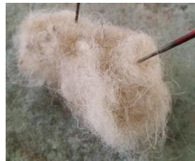
Continue rolling and needle felting, catching in the loose end fibres and rounding off.