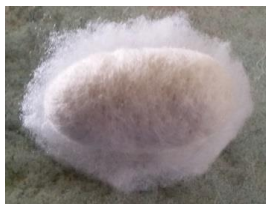
Lay the body onto thick wadding and cut into an oval for the prickle overcoat.