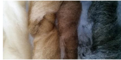
Colours of felting fibres from left to right – cream, dark cream, light brown and dark grey.