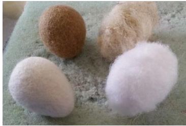
Different cores that can be used. Top left pre-felted small egg. Bottom left pre-felted larger egg. Top right rough wool fibre toy filling. Bottom right wadding.