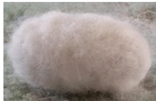
Continue until fully covered so no gaps from the core show through.