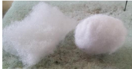
Egg shaped body made from a piece of thick wadding made in the same way as given below for the rough wool fibre.