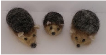
Different sizes using different core bodies.