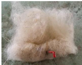
Tear away an 8-10cm length of core rough wool fibre, roll up quite tightly, securing with your felting needle as you go.