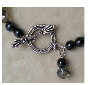
Beading wire can also be used in conjunction with crimp beads and calottes to make earrings.