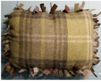
Bolster and Small Lumbar Cushion

The bolster cushion is made very similar. As it is a cylindrical shape with no square sides the fabric is cut as one length, folded in half length and width ways to snip the strips in. Tying the longer sides together first.