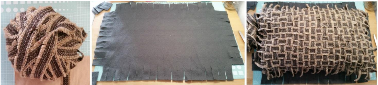
Blanket Yarn Woven Fronted Cushion

I had intended to use the braided edge given below but found the felt fabric on the bottom layer I was using, split in half on some of the strips as I was braiding, so ended up cutting all the strips in half again before tying - there's always a solution!