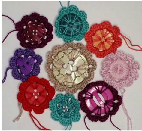
Crochet flower buttons using different styles of buttons