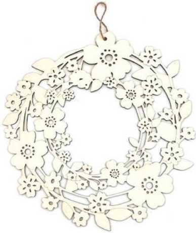
Wooden wreath undecorated

See the main image for ways in which I have created flowers with different shaped buttons - I am lucky to have an abundance of buttons to pick from. Packs of mixed buttons are available in good craft and haberdashery stores as well as online.